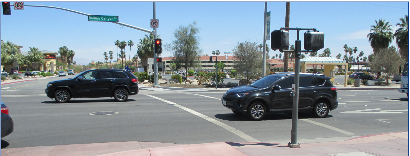
Indian Canyon Drive Two-Way Conversion City of Palm Springs