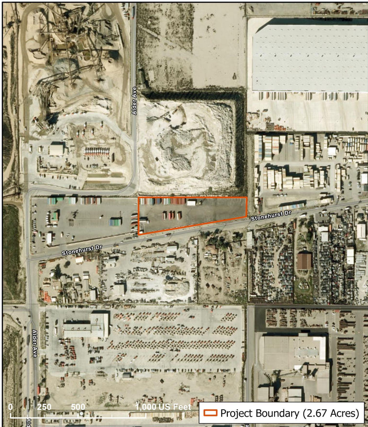
2160 Stonehurst, Rialto Figure 2 Local Project Vicinity