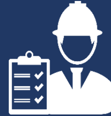
Mandatory Organics Disposal Reduction Ordinance