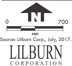
PROJECT VICINITY Rialto Fire Station 205 and Community Center City of Rialto, California