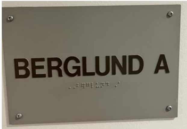
←Option B What the Senior Center Has