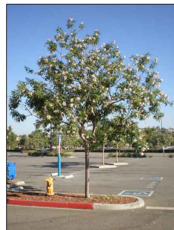
Chitalpa tashkentensis / Chitalpa