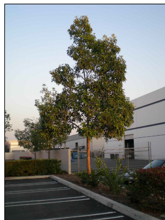
Tristania conferta / Brisbane Box