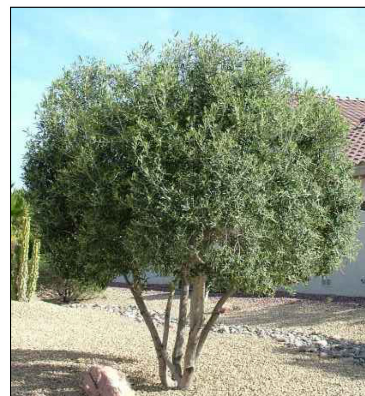
Olea europaea / Olive