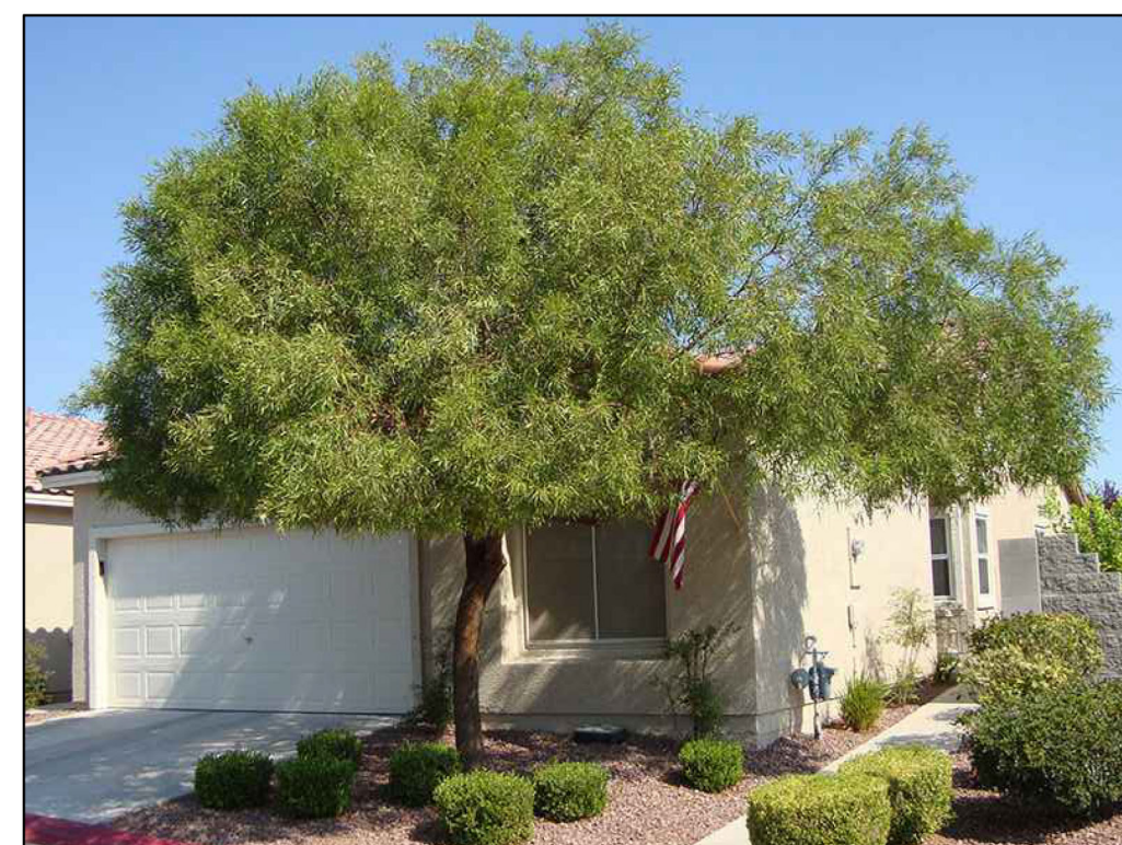
Rhus lancea / African Sumac