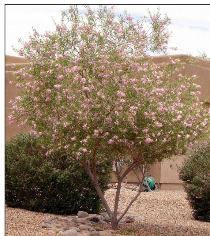
Chilopsis linearis / Desert Willow