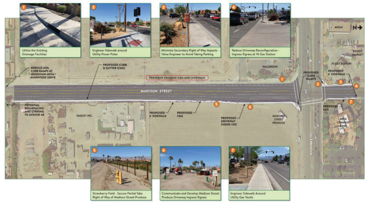
Conceptual design for Madison Street Widening in Indio