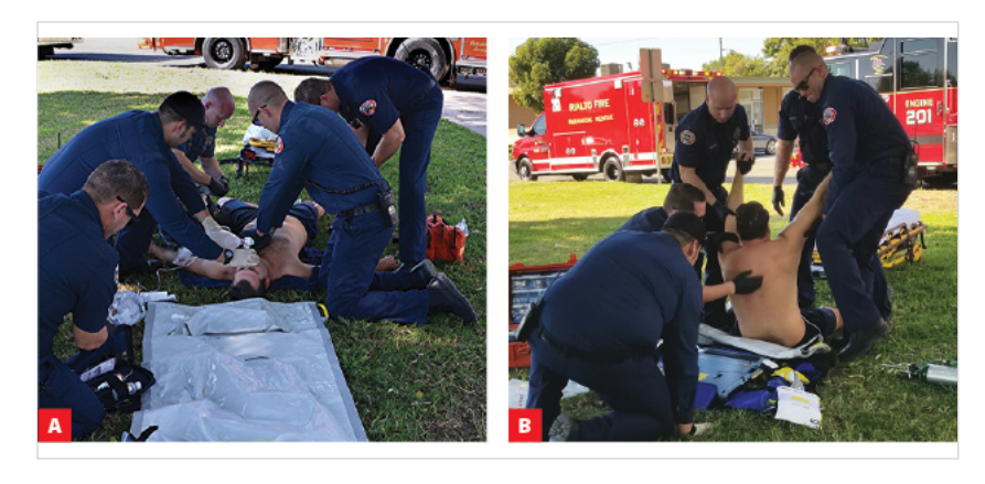
Rialto Fire Department's goal for automated CPR delivery is to initiate and maintain continuous, uninterrupted compressions as soon as possible after patient contact.

When applying the RFD Cardiac Survivability Tools to cardiac arrest patients, the RFD realized a 60% return of spontaneous circulation (ROSC) for all non-traumatic adult arrests; not just the very small number of patients that fit into the Utstein measurement, but all patients in cardiac arrest. By working hard at this process and unlearning previous assumptions, the RFD gleaned some keys to success.