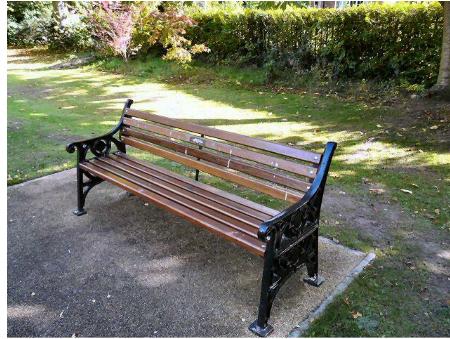
③ Park Bench 12" = 1'-0"