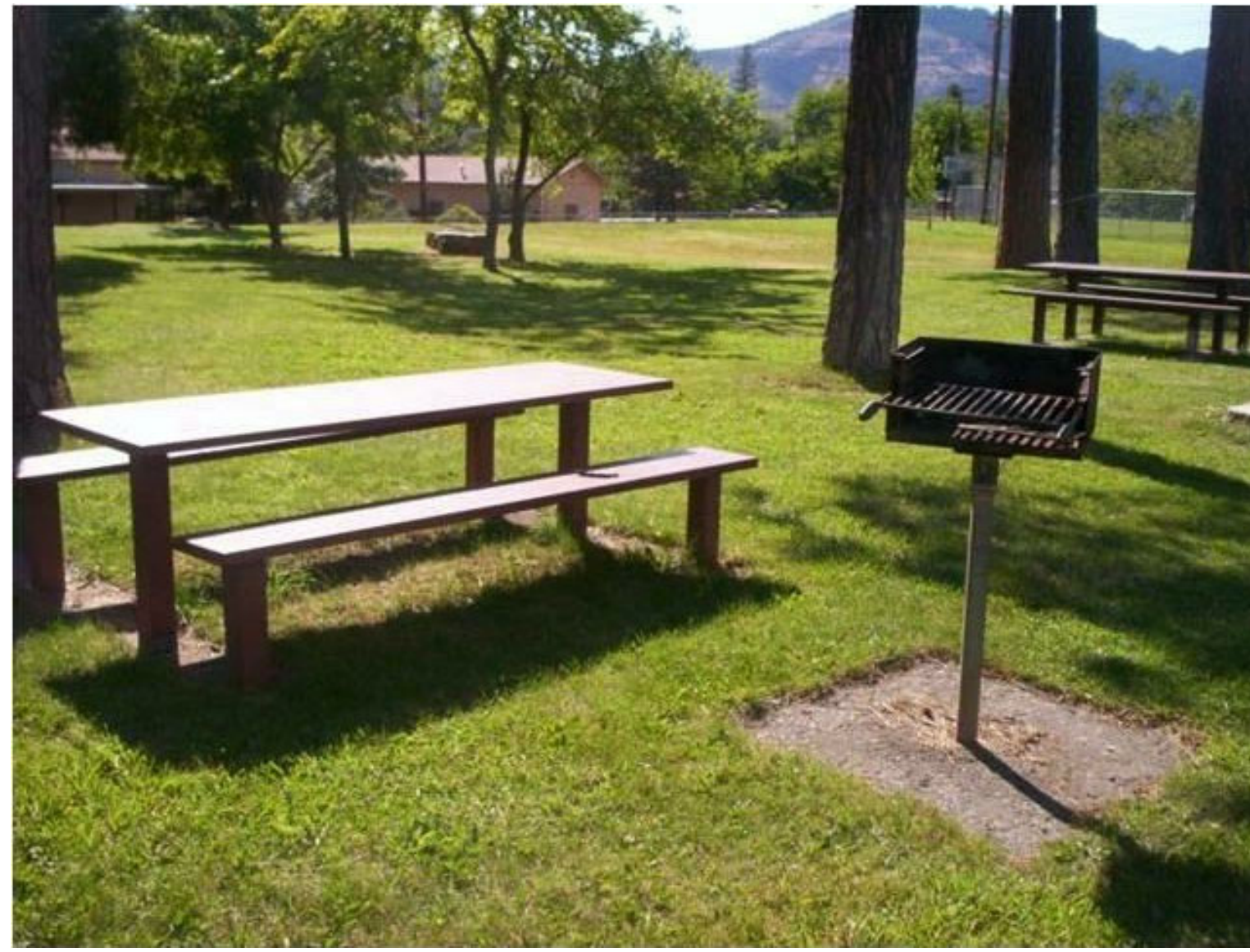
② Table & BBQ 12" = 1'-0"