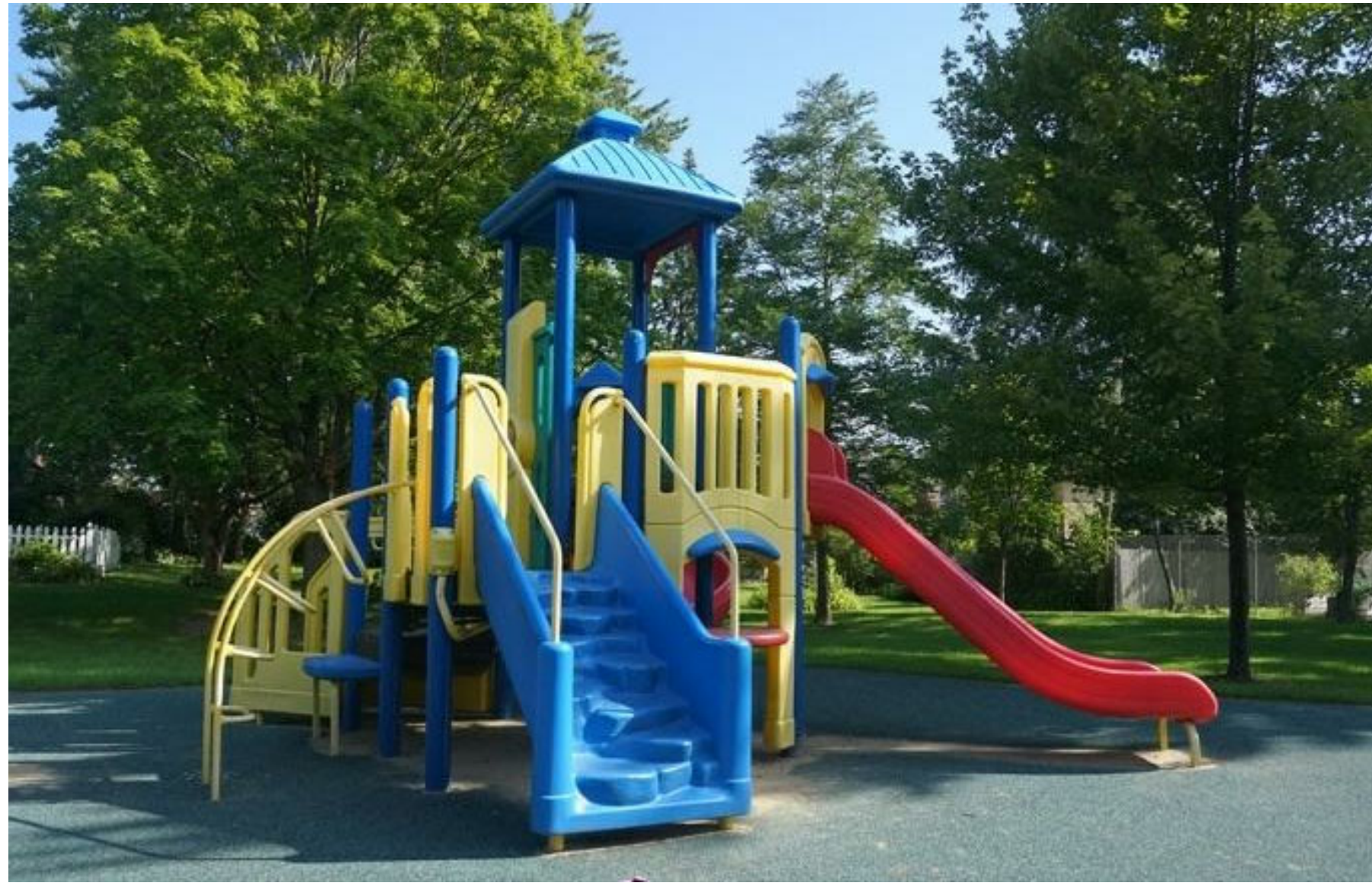
① Tot Lot 12" = 1'-0"