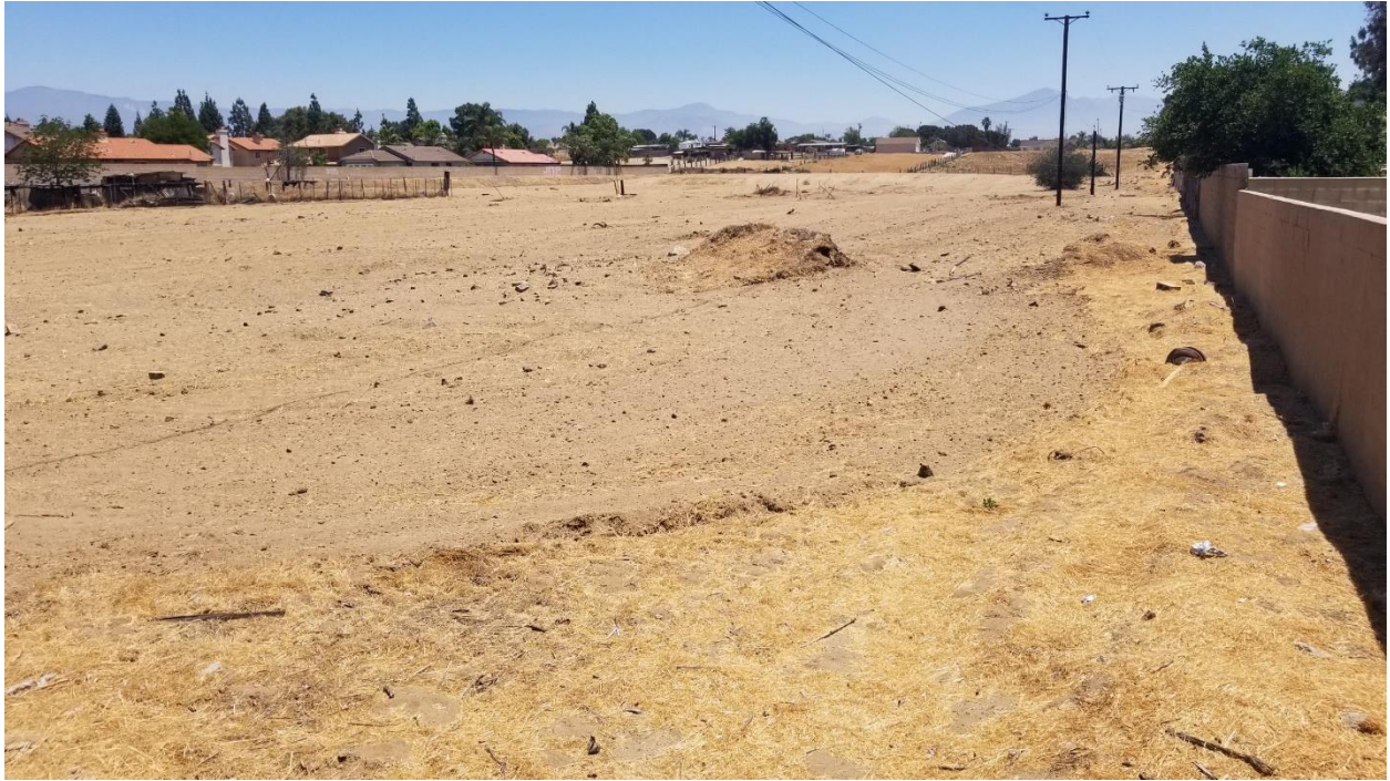
Picture 3. Overview of the site facing east from the southwestern corner.