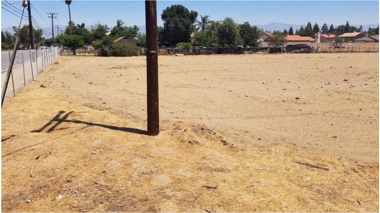
Picture 2. Overview of the site facing northesast from the southwestern corner of the site.