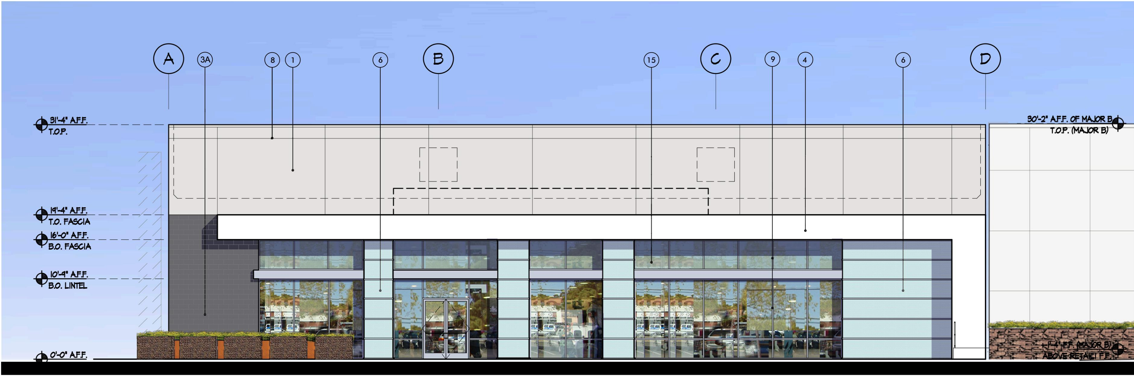
NORTH ELEVATION SCALE: 1/8"=1'-0"