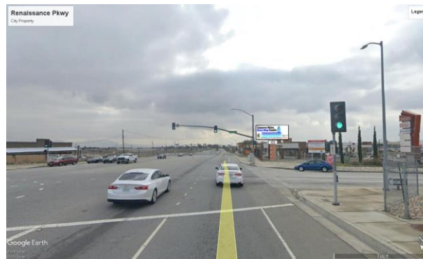
Southbound Ayala Drive