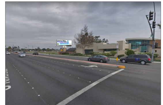
1401 S. Riverside Avenue