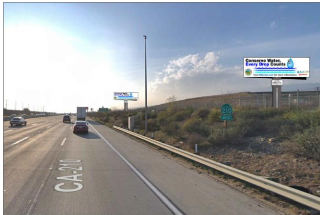
Westbound 210 Freeway