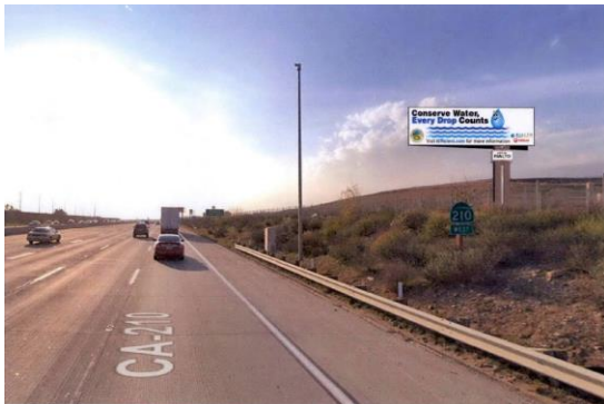
2605 W. Casmalia Street