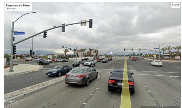
Northbound Ayala Drive