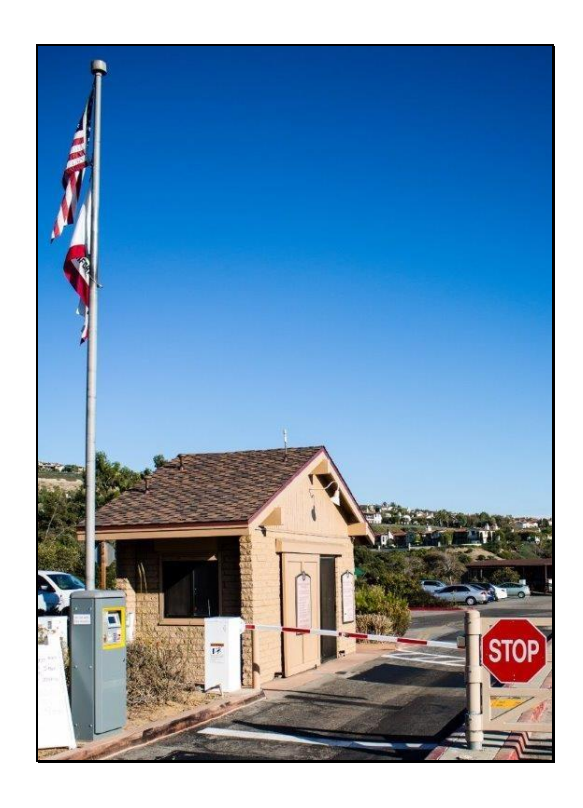
Gated Entry & Exit POF/PIL venSTATION