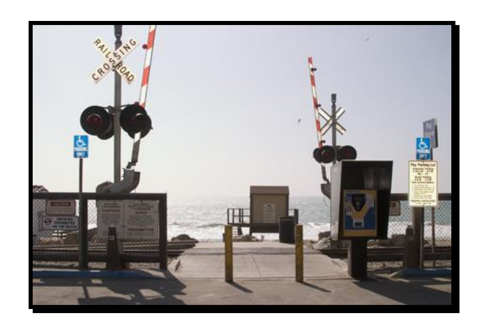
City of San Clemente SVI Metro Link Lot