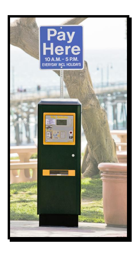
City of San Clemente Pier venSTATION