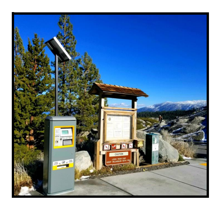
California State Parks Tahoe District-PBL