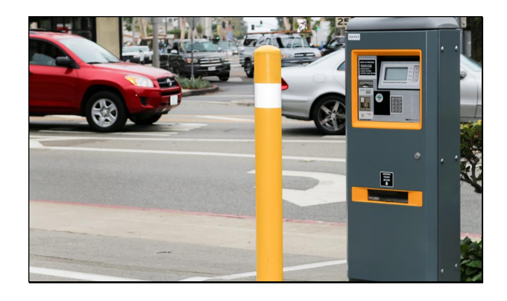
City of Laguna Beach M400 On-Street Short Term Parking (Replaces Single Space Meters)