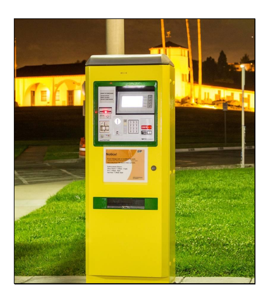
CSU Pomona Custom Color venSTATION