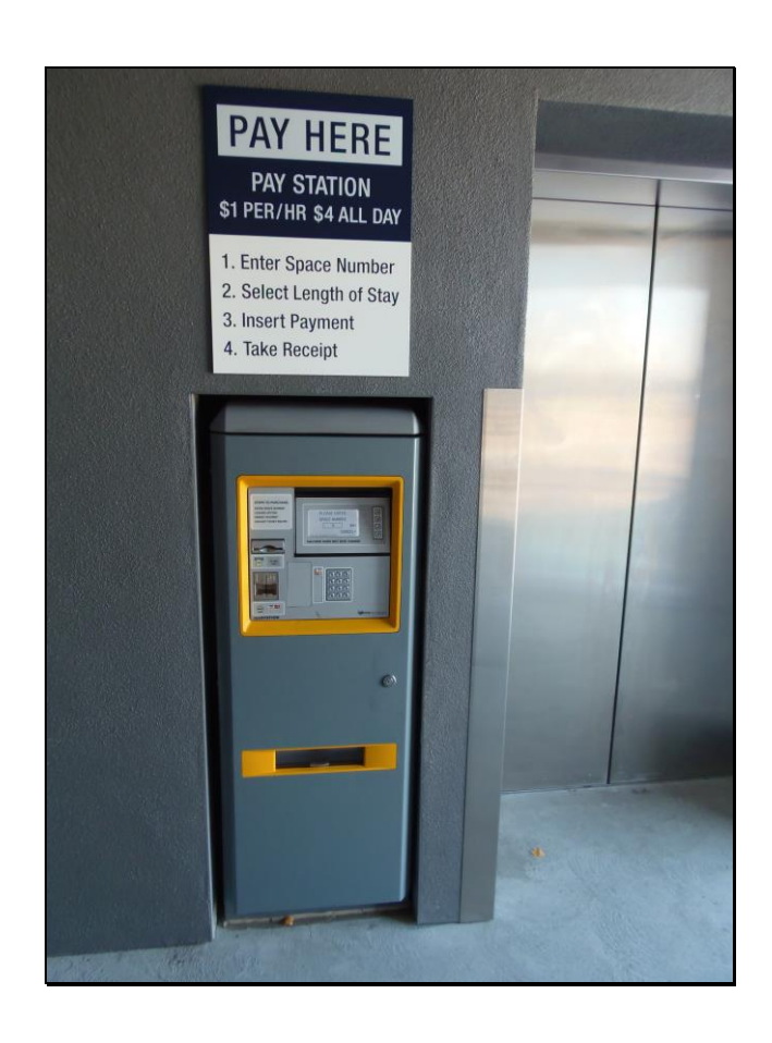
City of Westminster Elevator Lobby venSTATION