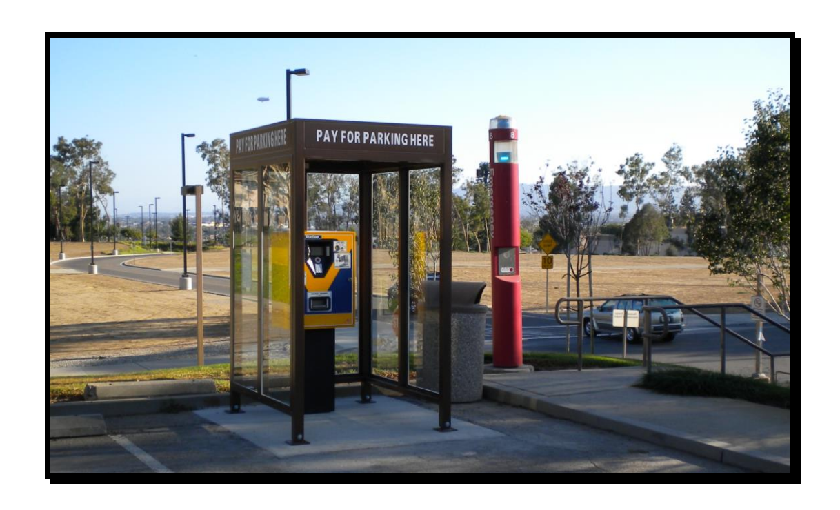
CSU Dominguez Hills SVI With Shelter-Emergency Phone