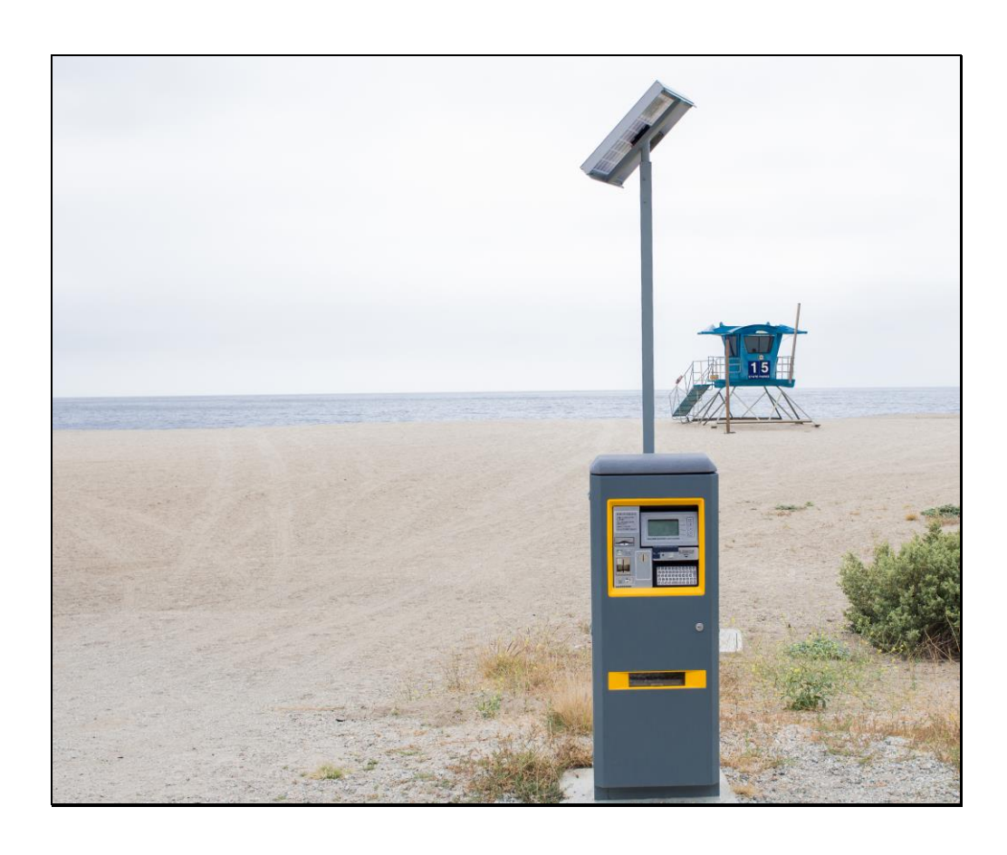
Angeles District CA Parks Malibu With Optional Tall Mast Solar