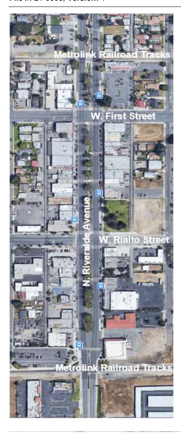
File #: 21-0508, Version: 1